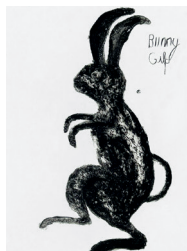
Kate Boxer Bunny Gilp ed. 30 drypoint & carborundum 78.5 x 55.5 cm