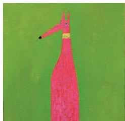
Michael Rees Pink on Green mixed media on canvas 20 x 20 cm