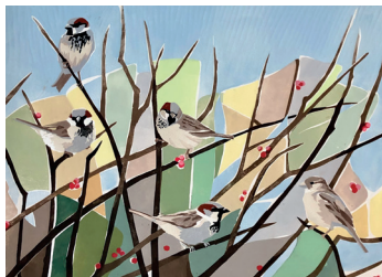
Lisa Hooper Spadgies in Haws ed. 12 reduction linocut 37.5 x 50 cm