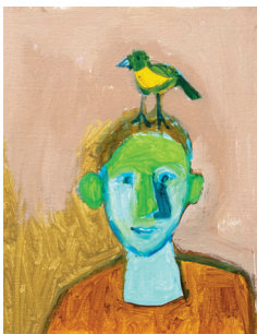
Matthew Batt Yellow Bird acrylic on board 45.5 x 35.5 cm