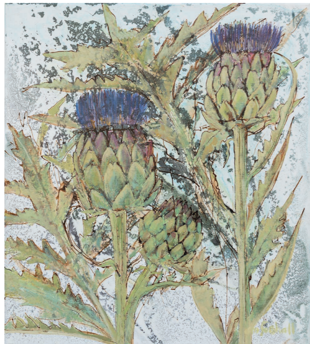
Fleurs d'Artichauts acrylic on canvas 27½ x 15¾ in / 70 x 40 cm