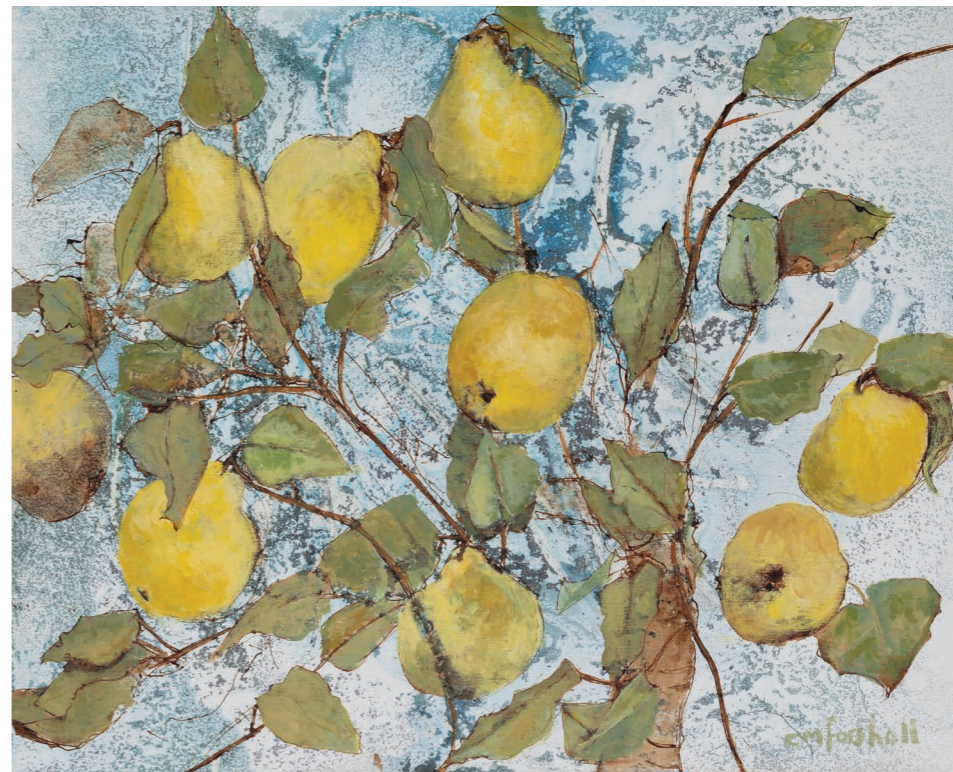
Les Coings acrylic on canvas 25 ½ x 31 ½ in / 65 x 80 cm