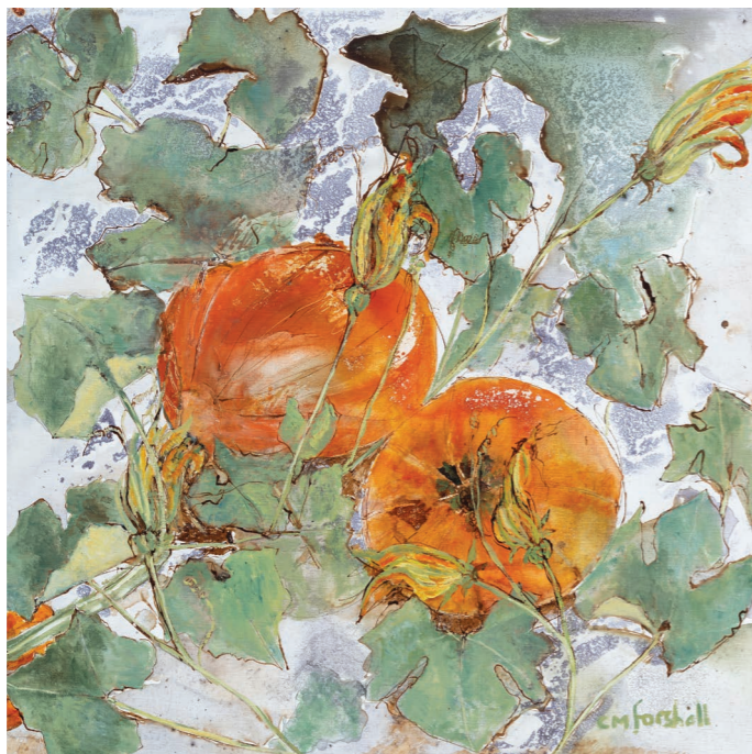
Potirons acrylic on canvas 23½ x 23½ in / 60 x 60 cm