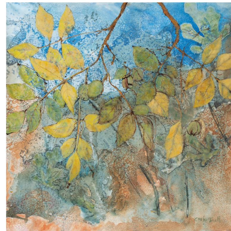
Walnut Grove acrylic on canvas 35½ x 35½ in / 90 x 90 cm