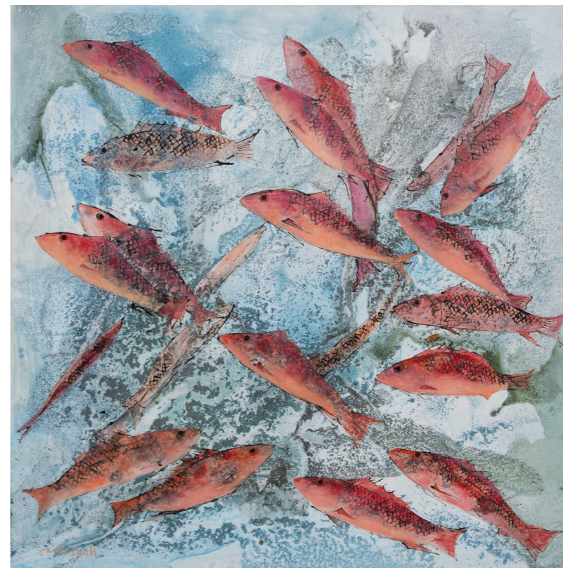
Les Vivaneaux acrylic on canvas 41¼ x 41¼ in / 105 x 105 cm