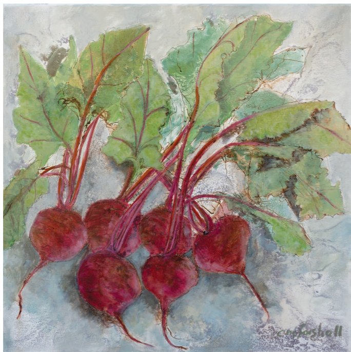
Les Betteraves acrylic on canvas 23½ x 23½ in / 60 x 60 cm