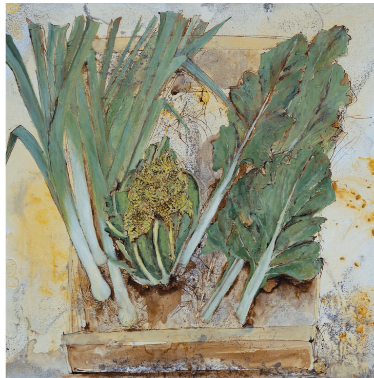
Potager acrylic on canvas 35½ x 35½ in / 90 x 90 cm