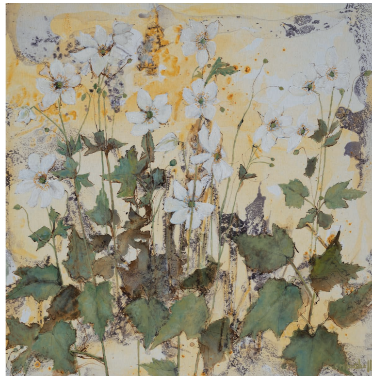
Japanese Anemones acrylic on canvas 35½ x 35½ in / 90 x 90 cm