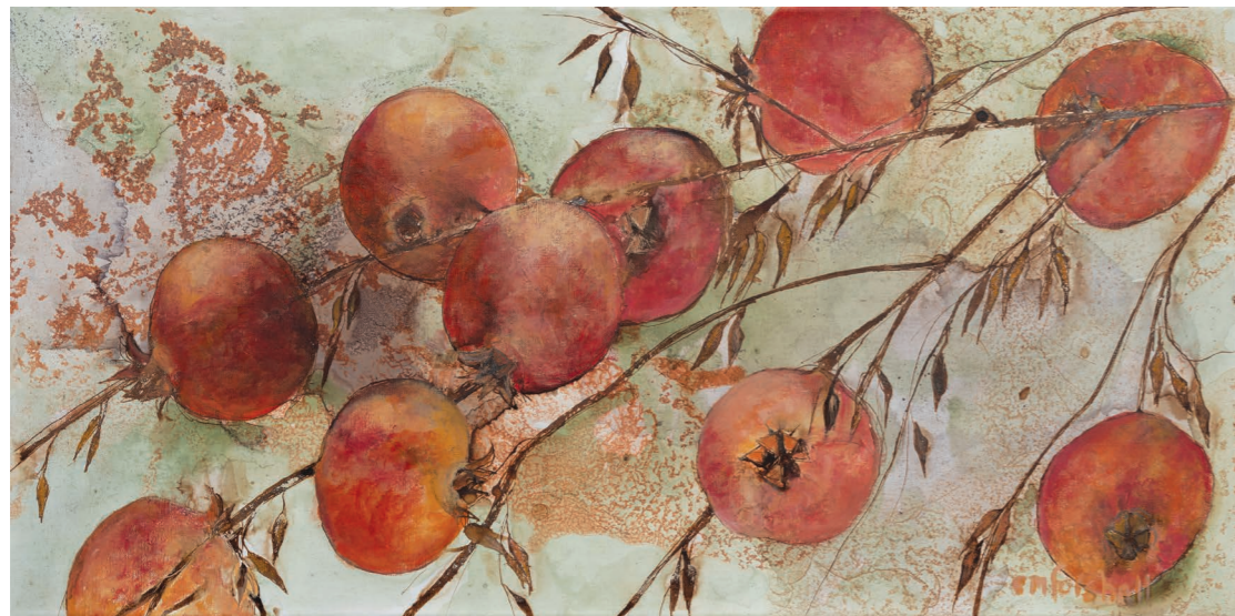
Les Grenades acrylic on canvas 15 ¾ x 31 ½ in / 40 x 80 cm