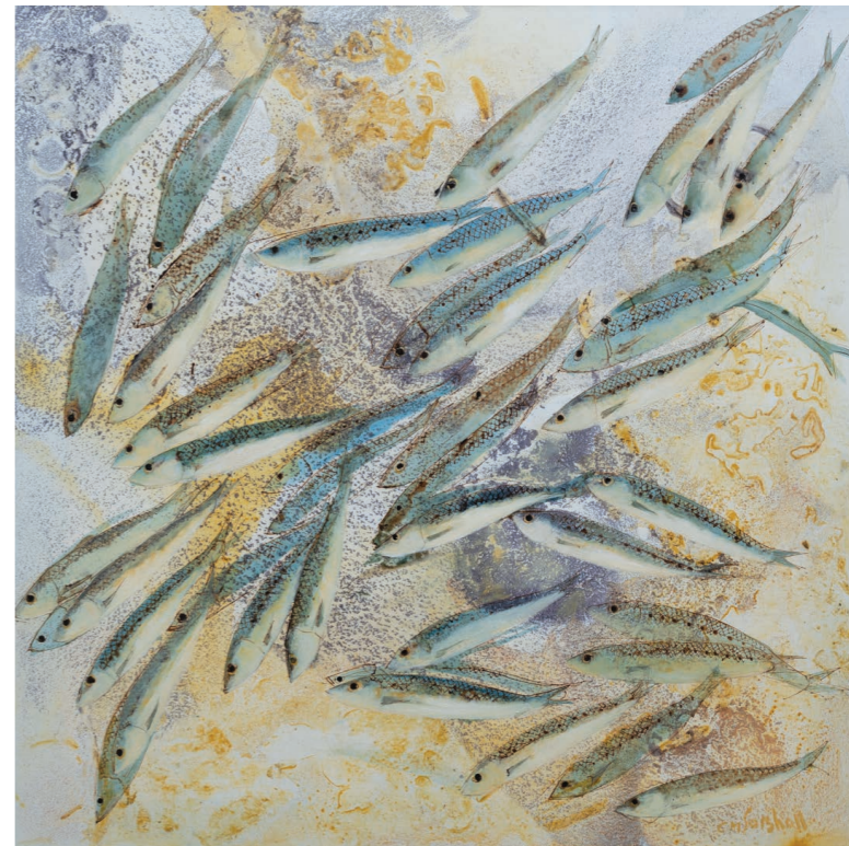
Porthallow Sardines acrylic on canvas 35½ x 35½ in / 90 x 90 cm