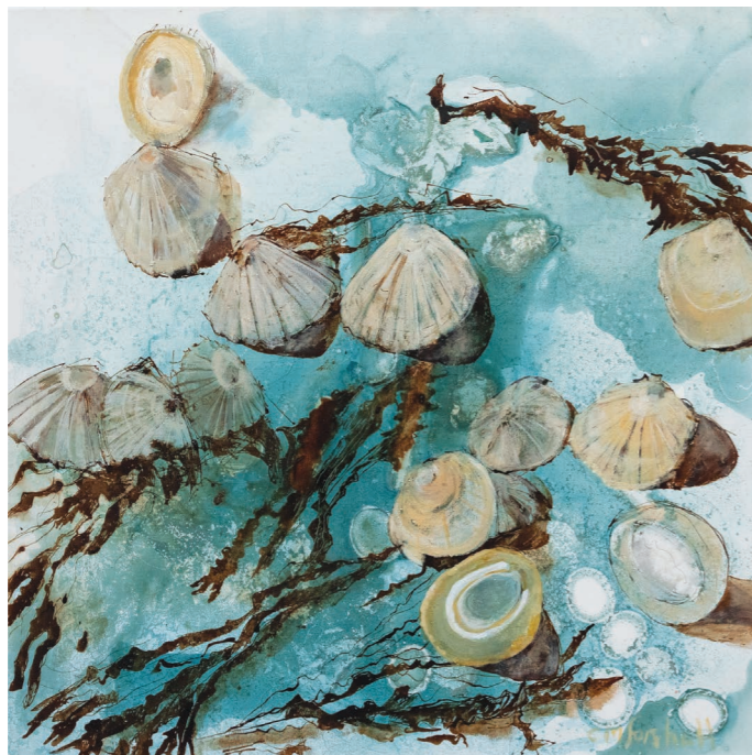
Les Patelles acrylic on canvas 23½ x 23½ in / 60 x 60 cm