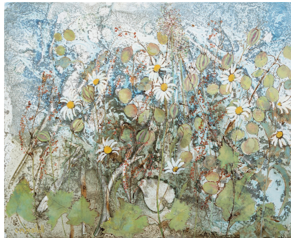
Les Marguerites acrylic on canvas 27½ x 31½ in / 70 x 80 cm