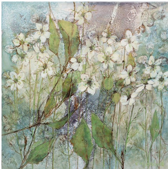
Love in a Mist acrylic on canvas 23½ x 23½ in / 60 x 60 cm