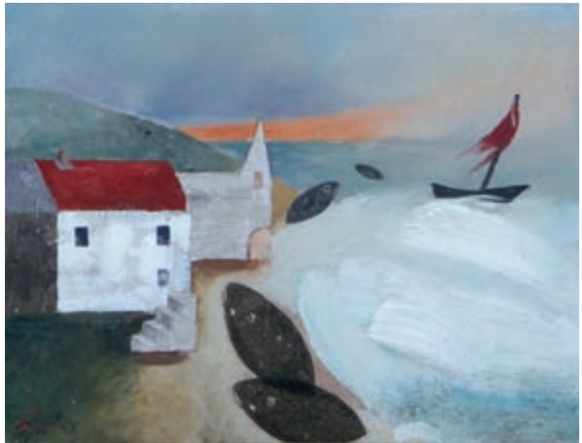
Keith Purser Steps to Evening 2010 oil and mixed media on board 16 x 20 1/2 ins ▲