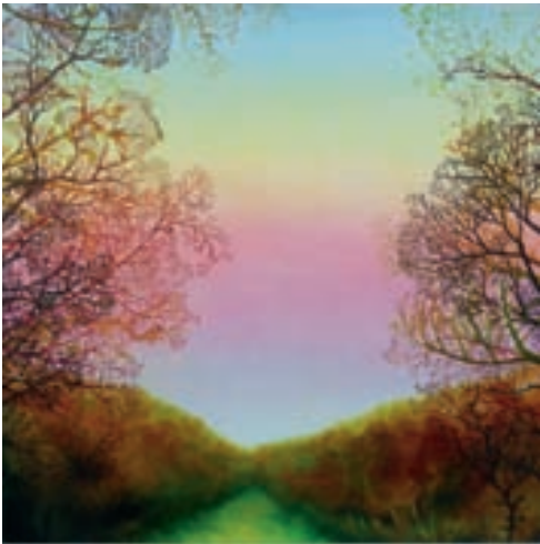
◀ Sara Philpott Walk into Spring 2010 oil on board 24 x 24 ins