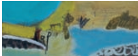
▲ Tony Scrivener Beach at Hayle 2009 mixed media on paper 4 1/2 x 11 ins