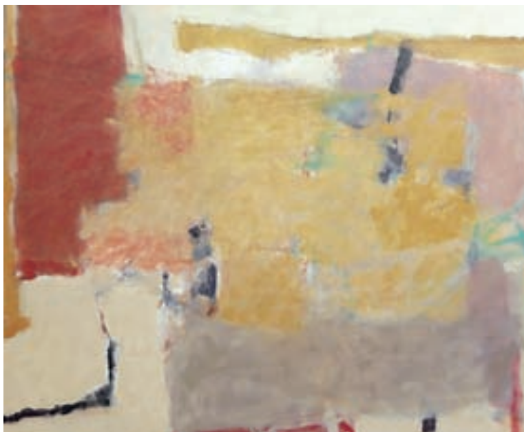
Ingrid Wilkins Red Painting with Black Line 2010 oil on canvas 42 x 50 ins