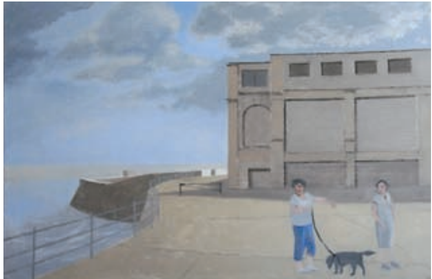
◀ Front Matthew Batt Me and You 2008 acrylic on canvas 32 x 40 ins