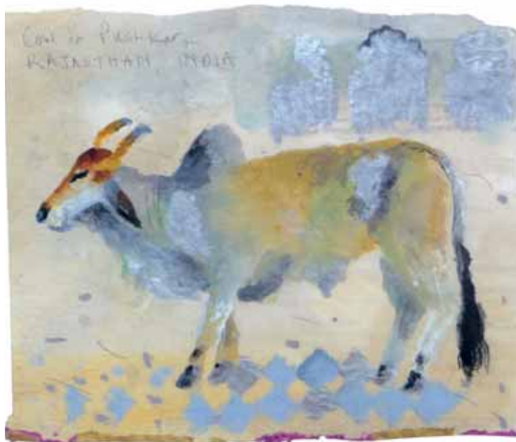
Clare Sprawson Cow in Pushkar, Rajasthan watercolour on paper 9½ x 11 ins