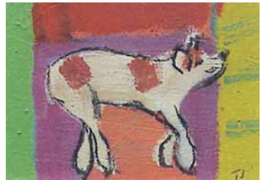
Tony Scrivener Cool Dog mixed media on paper 5 x 7 ins ▲